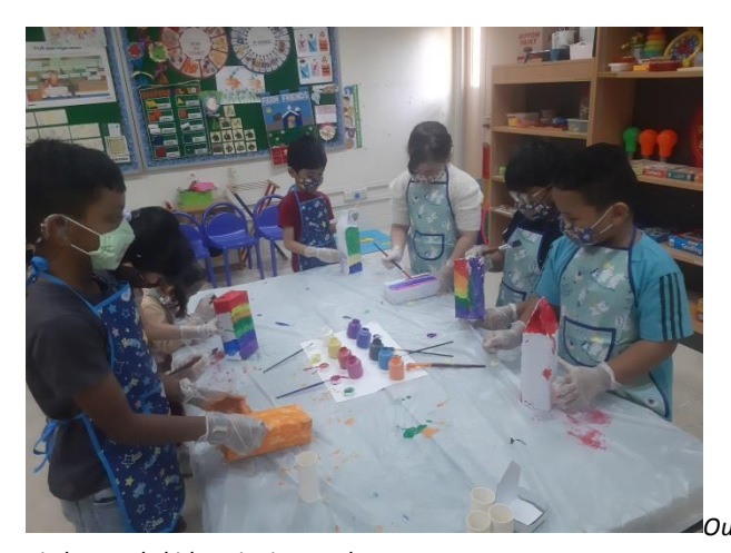
Little Hands kids enjoying art lessons