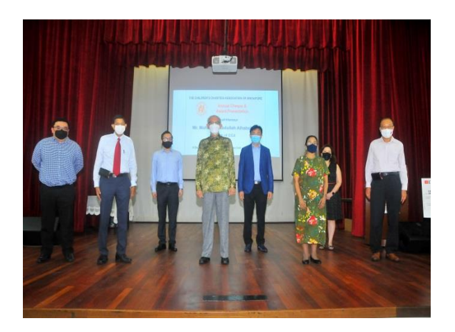
CCA Board of Directors with Guest of Honour