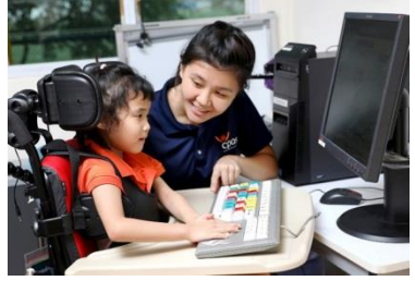
CPAS School (CPASS) For children between 7 and 18 years old

six domains. For selected students with good motor and functional skills, their curriculum includes pre-vocational training.