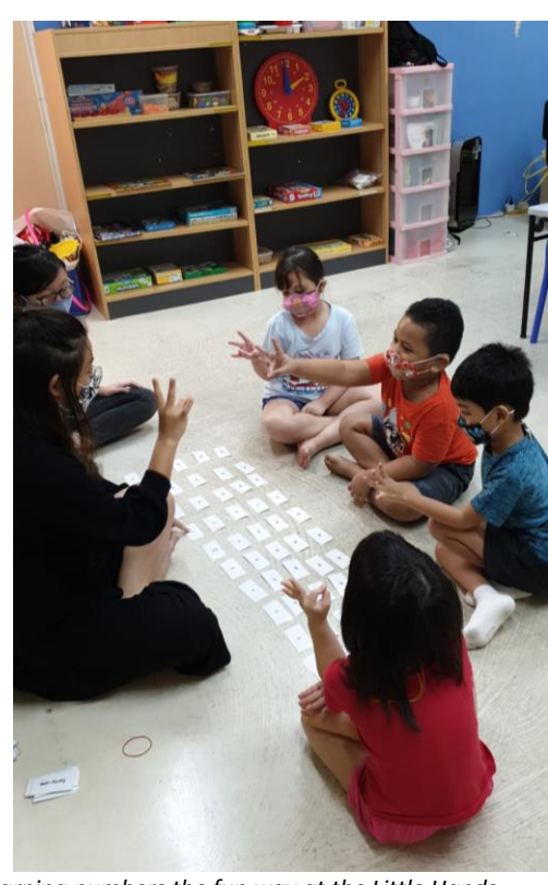
Learning numbers the fun way at the Little Hands Bi-Bi Programme!