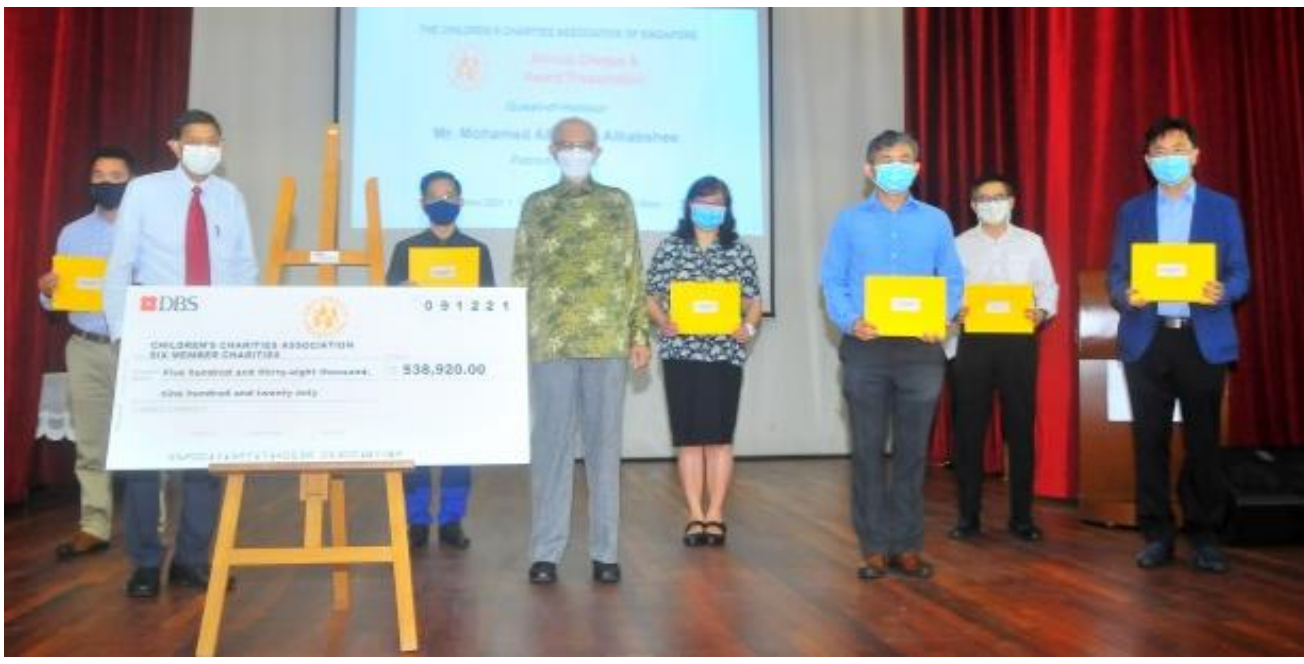
Representatives from Members with their cheques