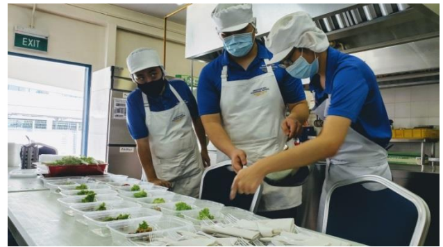
Mountbatten Vocational School

AFFILIATED SCHOOL: Mountbatten Vocational School (MVS) The school is an ITE Approved Training Center which caters to students with special needs from the ages of 14 to 21. MVS offers a two-year ITE Skills Certificate programme in Food and Beverage Service, Food Preparation, and Housekeeping Operations.