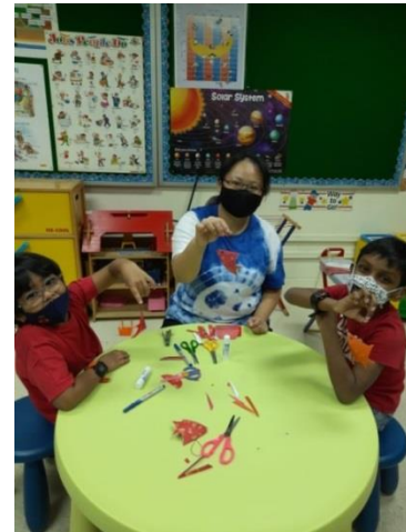
Little Hands Bilingual-Bicultural Programme