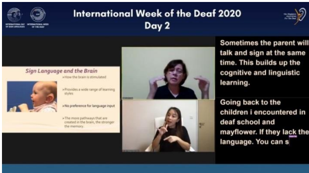
International Week of the Deaf 2020

With effect from 1 October 2020, SG Enable took over NCSS and MSF in the area of programme and funding.