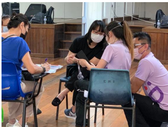
SgSL Interpreter in action

SADeaf is a member of the National Council of Social Service (NCSS), and also supported by Community Chest of Singapore, Ministry of Social and Family Development (MSF) and Ministry of Education (MOE). The association is also affiliated internationally, to the World Federation of the Deaf (WFD) and, locally, to The Children's Charities Association of Singapore (CCA). SADeaf's mission is to assist the Deaf and Hard-of-hearing to achieve a better quality of life and to enable them to integrate and contribute to society.