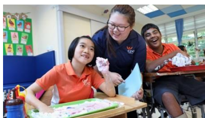
CPAS School (CPASS)

EIPIIC provides early intervention for children with identified needs between the ages of a few months to six years old. A Trans-Disciplinary Approach is integrated into the curriculum. A multi-disciplinary team collaborates with caregivers to provide holistic education and support to help each child maximise his or her developmental growth.