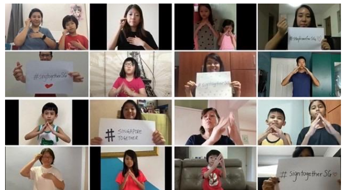
Mayflower Primary School

In addition, SADeaf provides Specialised Teachers, Education Interpreters and Resource Teachers to the Mayflower Primary School and Beatty Secondary School respectively to support the Deaf and Hard-of-hearing students in the mainstream school. The association has also started a communication and language programme for children with hearing loss below seven years old (Little Hands Bilingual-Bicultural Programme).