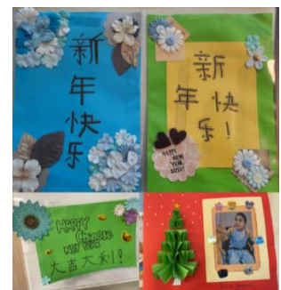
Festive cards for our patients handcrafted by student volunteers

Despite the challenges brought about by the pandemic, our supporters went the extra mile to bring love and cheer to our children and care team. From handmade festive greeting cards to festive decorations and care packages, we were honoured to receive these thoughtful gestures from volunteers, schools and organisations. These efforts brought our children and care team much encouragement.