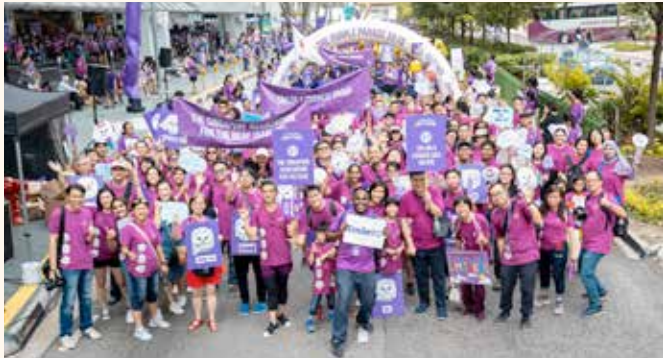
SADeaf Purple Parade

The Singapore Association for the Deaf (SADeaf) has been serving the Deaf and Hard-of-hearing community in Singapore for the past sixty years. Established in 1955, it now serves more than 6,000 Deaf and Hard-of-hearing persons and provides a gamut of services such as sign language interpretation, note-taking, Deaf awareness workshops, employment support, counselling and financial assistance, and recreational activities.