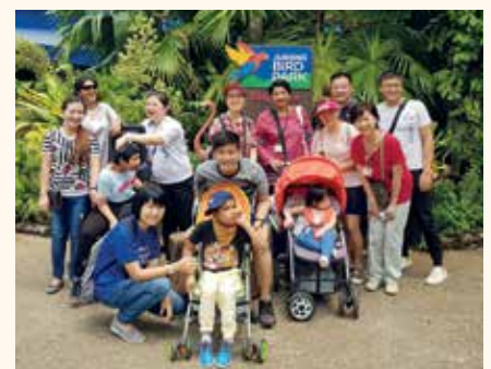
SACH Paediatric Care team and volunteers with our paediatric patients during a community outing to Jurong Bird Park. Such outings provide the opportunity for the children to socialize and bond with the volunteers.

Throughout the year, our paediatric patients were engaged in monthly programmes such as sing-a-long sessions hosted regular volunteers who provided musical accompaniment. These programmes lifted the spirits of the patients and were enjoyed immensely by them.