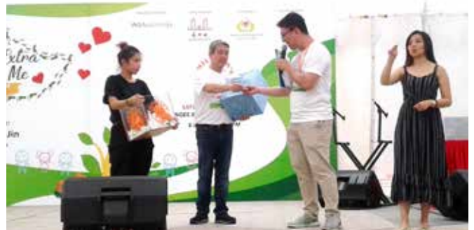
Lucky Draw - Fair 2019