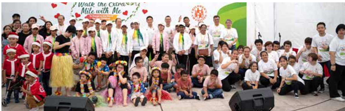
Children performers from Members