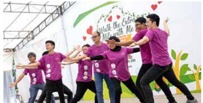
Signique from SADeaf at Fair 2019