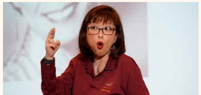
Deaf Culture and Sign Language