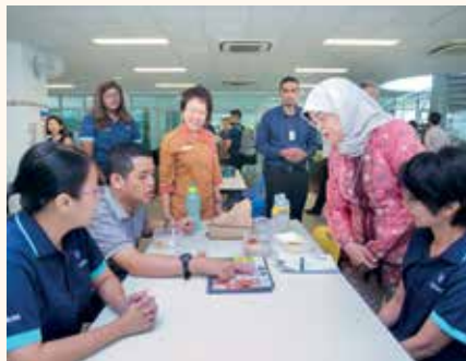
President Halimah Yacob visited SAAS on 24 September 2019 and showed a keen interest in understanding how students with autism use Augmentative and Alternative Communication tools.

visited the school as part of the Istana's community engagement efforts. During the two-hour visit, the President interacted with students and teachers, observed the Colours Café vocational programme for senior students and the use of Augmentative and Alternative Communication tools as well as a class of students engaged in learning pre-vocational skills via beading. She addressed the press, urging employers to improve work environment and processes to make room for persons with special needs to work, building a more inclusive Singapore.