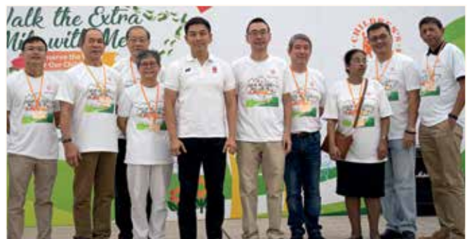
Board Members & Fair Committee Members with Guest-Of-Honour, Mr Tan Chuan Jin