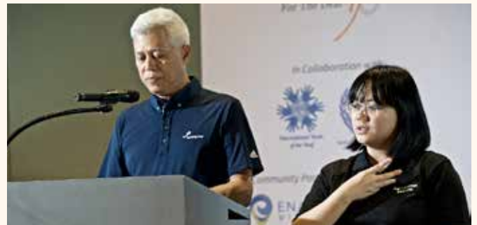
Sign Language Interpreting