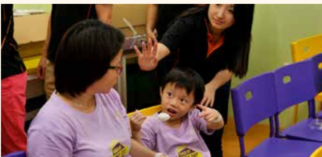
Community Services: Family Day

SADeaf is a member of the National Council of Social Service (NCSS), and also supported by Community Chest of Singapore, Ministry of Social and Family Development (MSF) and Ministry of Education (MOE). The association is also affiliated internationally, to the World Federation of the Deaf (WFD) and, locally, to The Children's Charities Association of Singapore (CCA). SADeaf's mission is to assist the Deaf and Hard-of-hearing to achieve a better quality of life and to enable them to integrate and contribute to society.