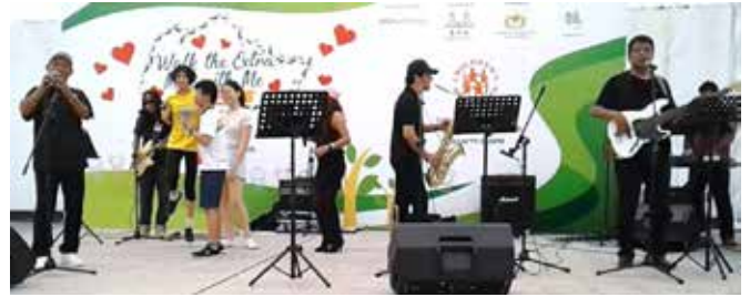
Band - 1st Fusion at Fair 2019