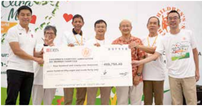
Representatives from Members receiving the "Big Cheque"