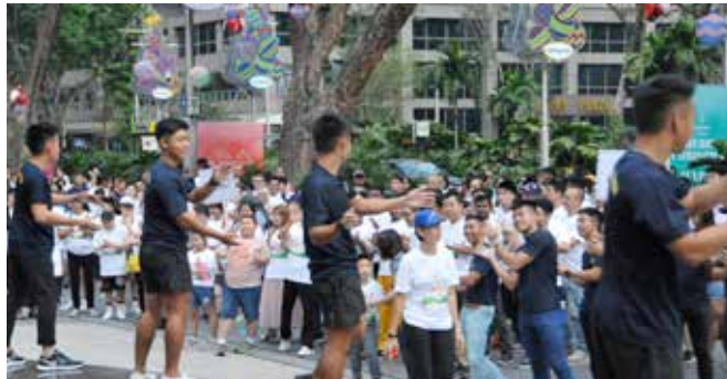
Warm-up before Walkathon