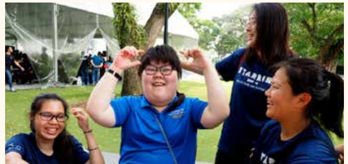
Mountbatten Vocational School

the ages of 16 to 21. MVS offers a two-year ITE Skills Certificate THE SINGAPORE ASSOCIATION FOR THE DEAF programme in Food and Beverage Service, Food Preparation, and Housekeeping Operations.