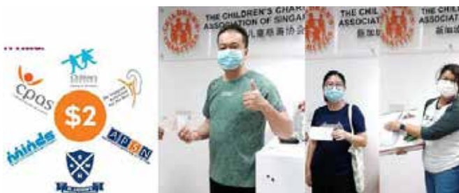
Winners of Donation Draw 2020