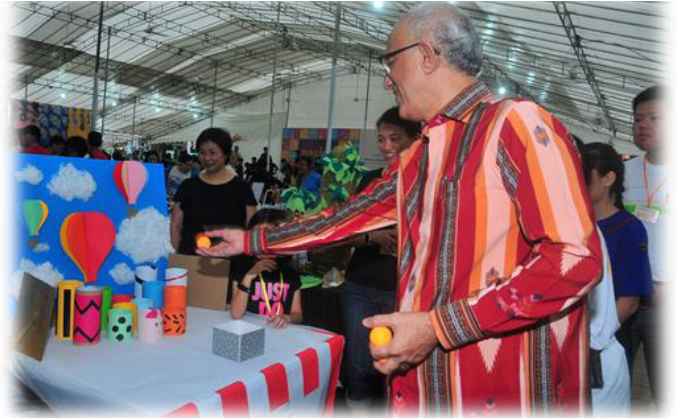
Patron at the Fair's Games Stall