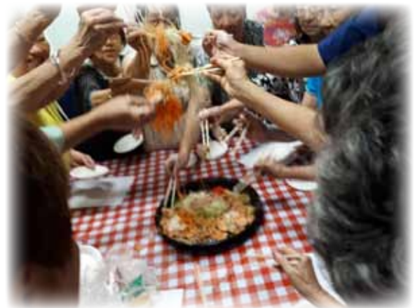
CCA Volunteers at Lunar New Year gathering