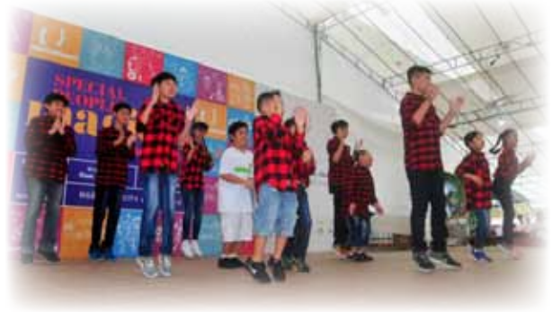
CCA Fair Concert